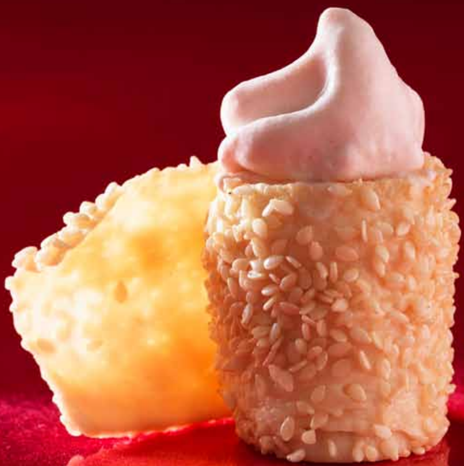
paper of chicken with cranberry espuma