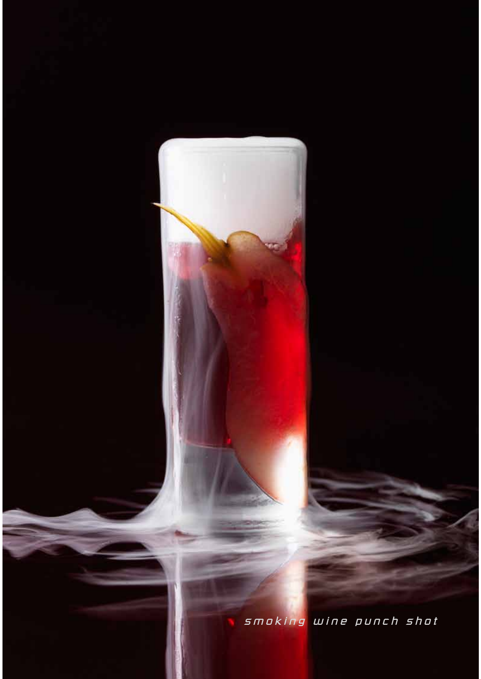
smoking wine punch shot