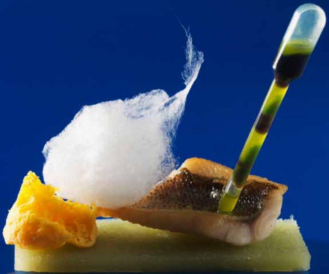
perch filet on cucumber stripes with carrot foam