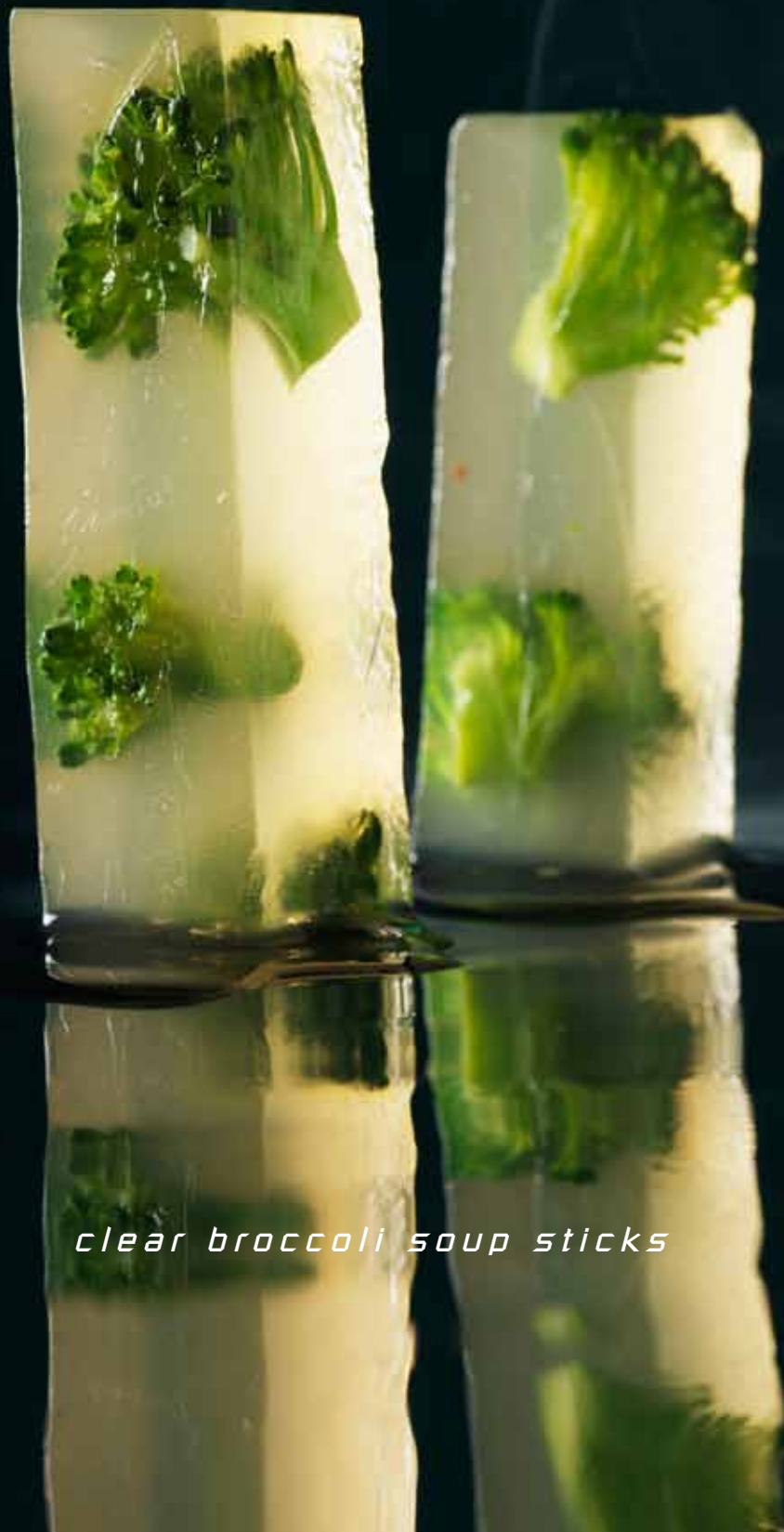
clear broccoli soup sticks