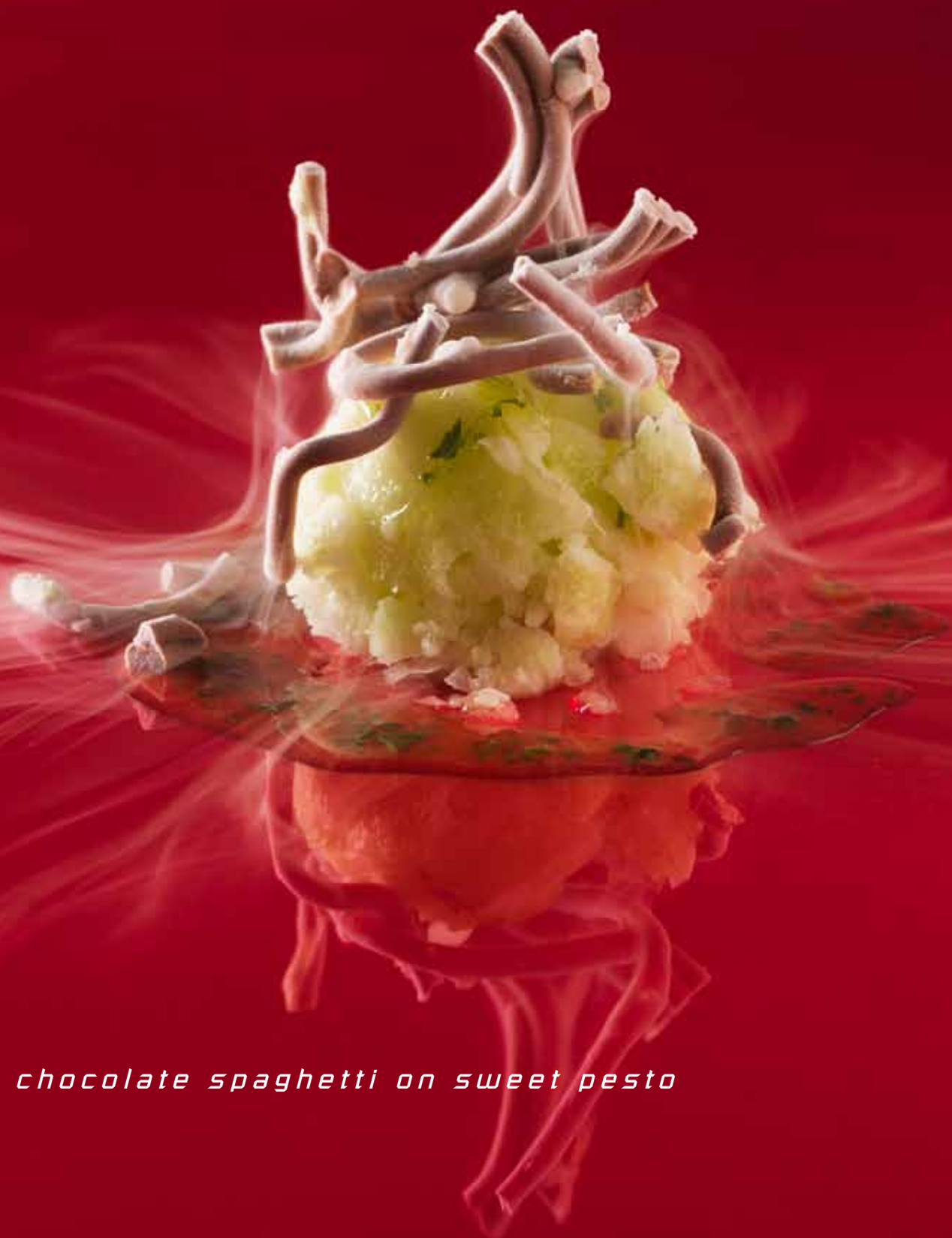
chocolate spaghetti on sweet pesto