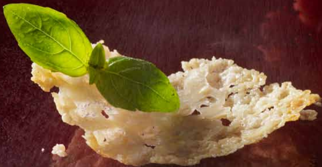
tomato vaporizer and parmesan chips