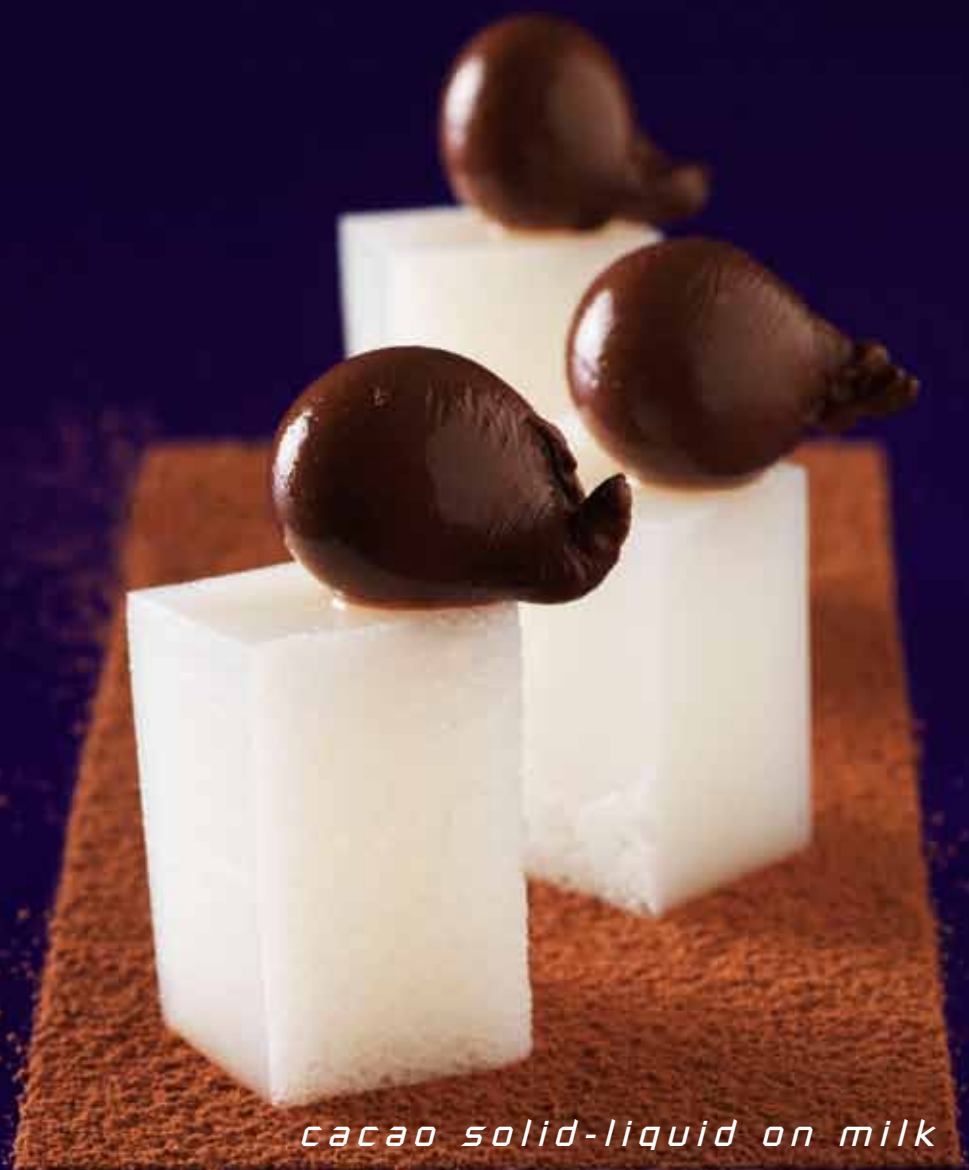
cacao solid-liquid on milk